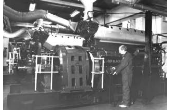
Lister Blackstone Engine Set

And then in 1966 a 950kW Lister Blackstone with a 16 cylinder diesel engine was added to the station. At that time the average load was 1200kW. In 1972 the next generating set to be installed was a Paxman V12 with a rated output of 1000kW. This was virtually the same as fitted to the early InterCity trains with an output of 2000BHP. The locos had one at each end. The engine used a fabricated crankcase and block as opposed to cast steel on the Lister Blackstones. This has proved problematic over the years due to the development of hairline cracks making it difficult to repair oil and water leaks.