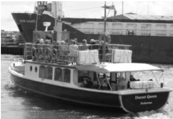
SWEHS Weekenders set off from Poole