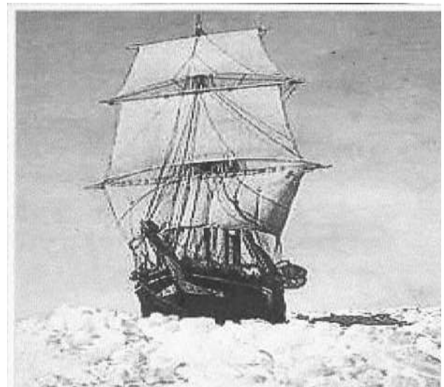
Shackleton's Ship "Endurance"